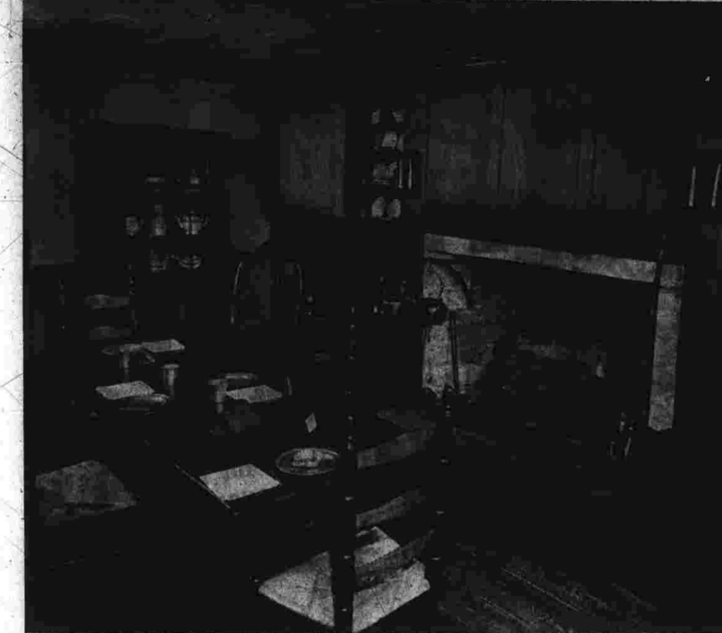
The dining room of the Nathan Hale Homestead shows the care taken to keep its furnishings typical of its period.