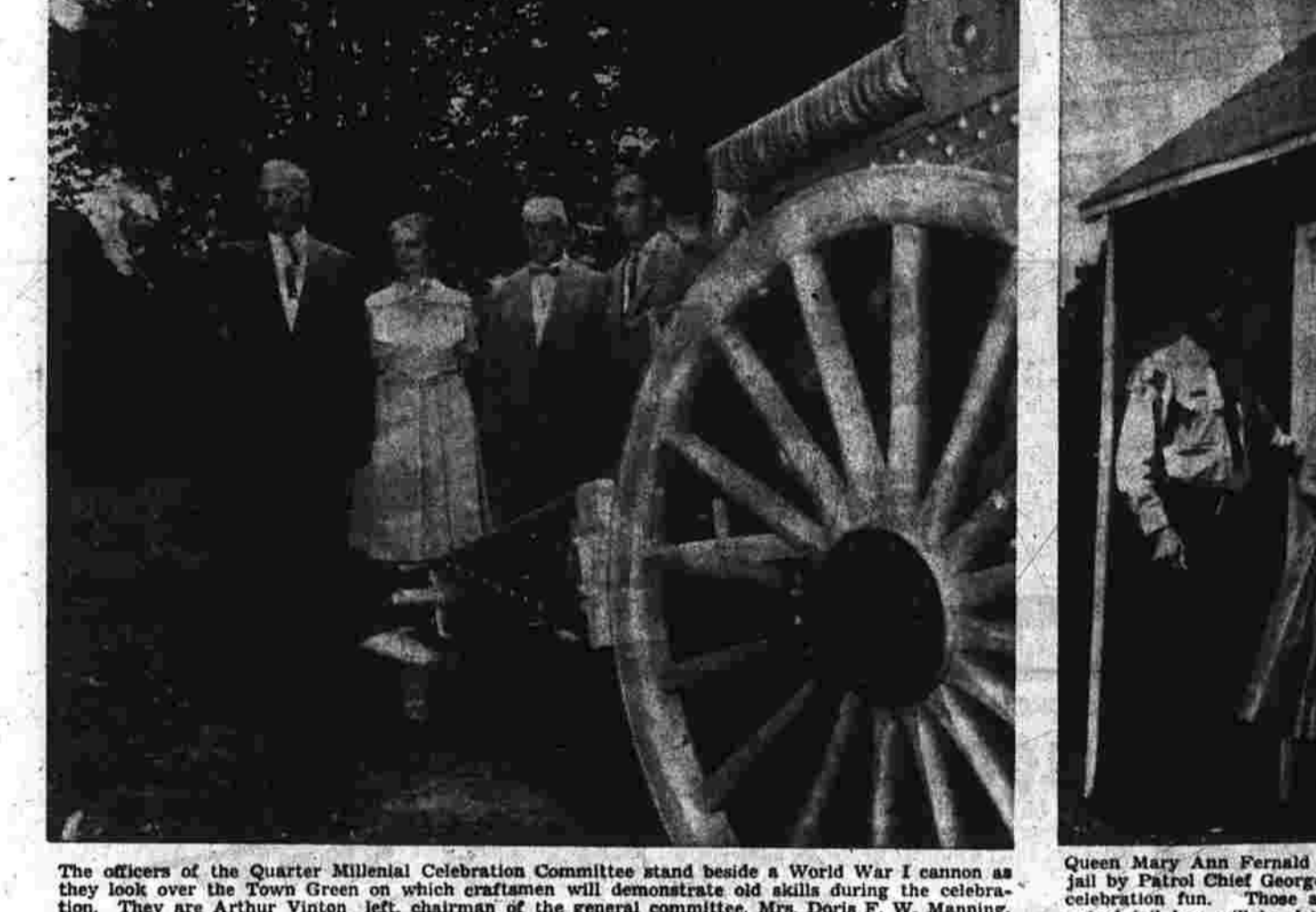
The officers of the Quarter Millennium Celebration Committee stand beside a World War I cannon as they look over the Town Green on which craftsmen will demonstrate old skills during the celebration.