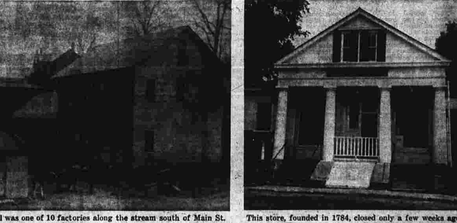
This store, founded in 1784, closed only a few weeks ago.