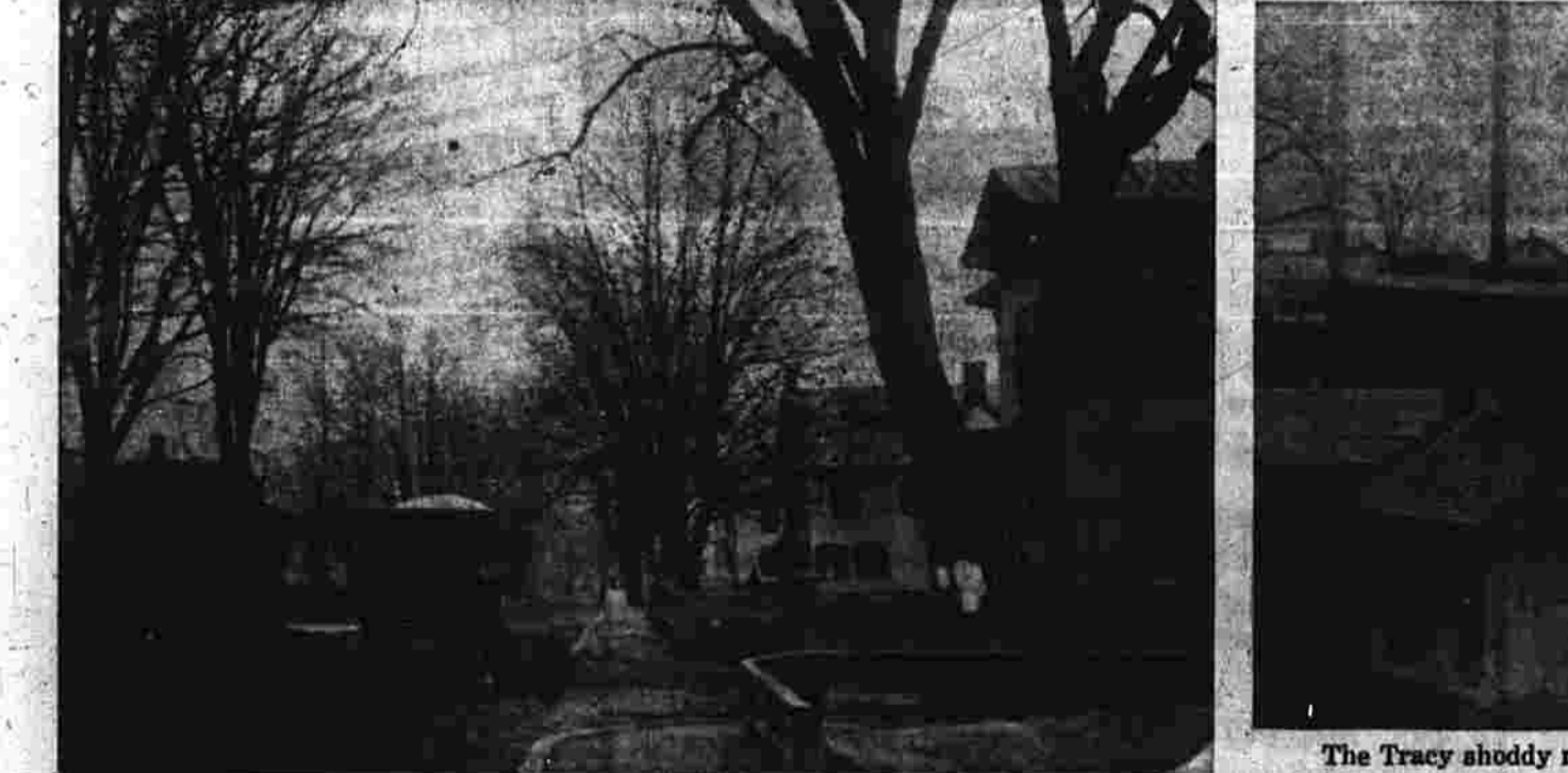
The Tracy shoddy mill was one of 10 factories along the stream south of Main St.